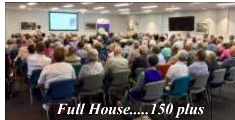
Full House....150 plus